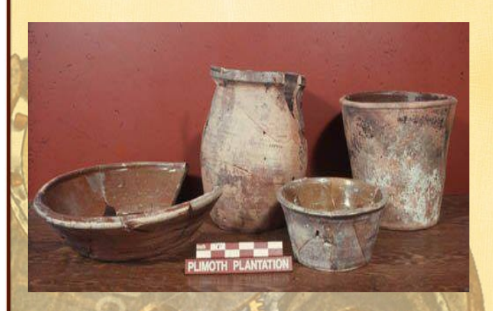
Redware milk pans and jars found at the Allerton farm

Why would the addition of cattle make such a difference?